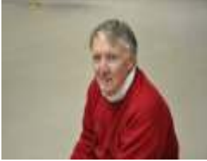
Just looking good!