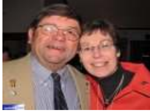
At the Oxford County Anniversary Dinner