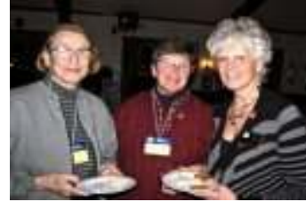
Same dinner February 6 in Norway